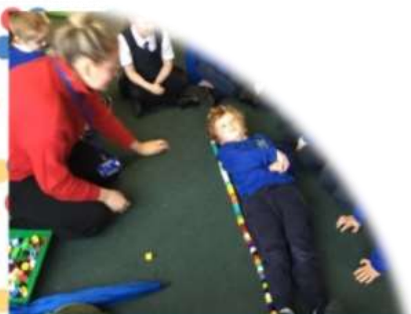
Measuring our classmates using cubes!