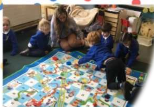
Snakes and ladders