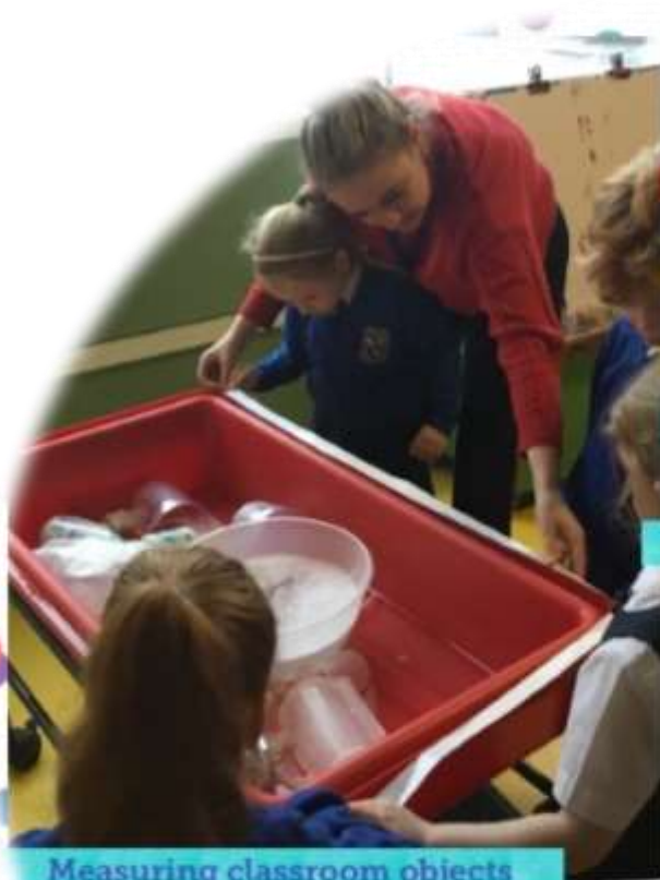
Measuring classroom objects